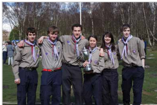
Another successful Geoffrey Gordon Cup