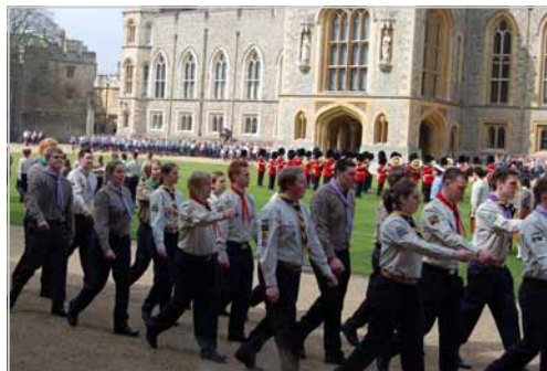
Queen Scout's at Windsor